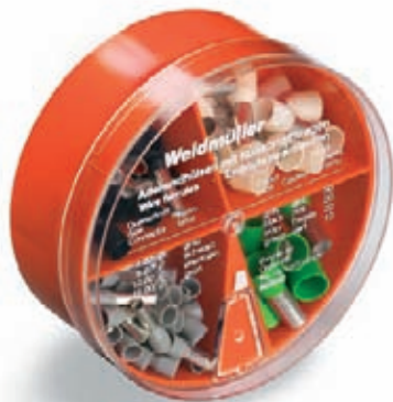
Box filled with wire-end ferrules with plastic collars: